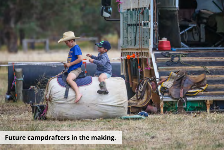
Future campdrafters in the making.